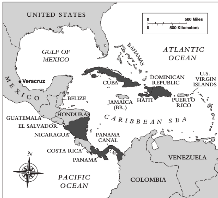
U.S. INTERVENTION IN THE CARIBBEAN, 1898 TO 1917

Conciliation Treaties Wilson's commitment to the ideals of democracy and peace was fully shared by his famous secretary of state, William Jennings Bryan. Bryan's pet project was to negotiate treaties in which nations pledged to (1) submit disputes to international commissions and (2) observe a one-year cooling-off period before taking military action. Bryan arranged, with Wilson's approval, 30 such conciliation treaties.