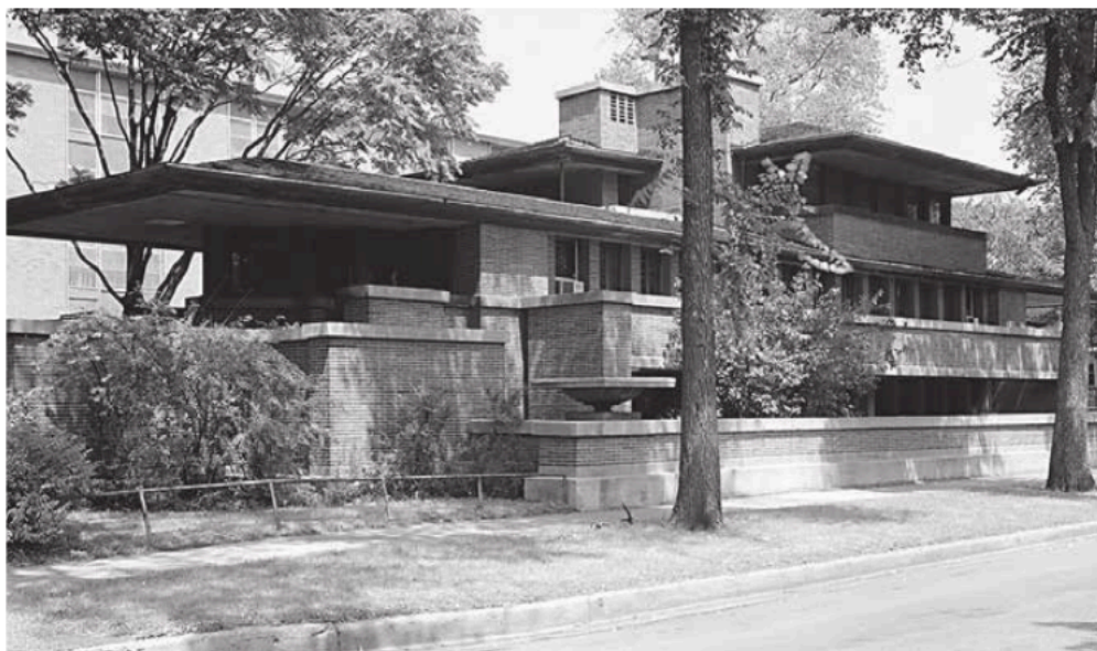
Frank Lloyd Wright, Robie House, Chicago, 1909.

Architecture In the 1870s, Henry Hobson Richardson changed the direction of American architecture. While earlier architects found inspiration in classical Greek and Roman styles, his designs were often based on the medieval Romanesque style of massive stone walls and rounded arches. Richardson gave a gravity and stateliness to functional commercial buildings. Louis Sullivan of Chicago went a step further by rejecting historical styles in his quest for a suitable style for the tall, steel-framed office buildings of the 1880s and 1890s. Sullivan’s buildings achieved a much-admired aesthetic unity, in which the form of a building flowed from its function—a hallmark of the Chicago School of architecture. Frank Lloyd Wright, an employee of Sullivan’s in the 1890s, developed an “organic” style of architecture that was in harmony with its natural surroundings. Wright’s vision is exemplified in the long, horizontal lines of his prairie-style houses. Wright became the most famous American architect of the 20th century. Some architects, such as Daniel H. Burnham,